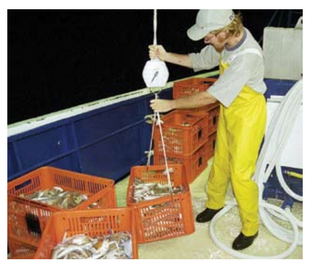
Skippers and crew members in the Northern Prawn Fishery help record information about bycatch for scientists and fishery managers.