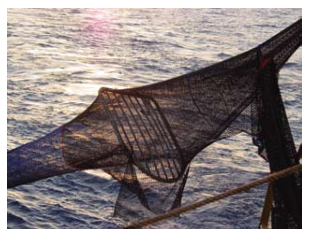
A Turtle Excluder Device in a prawn trawl net.

Australia has been successful in reducing bycatch in some fisheries because of the work these groups have done together.