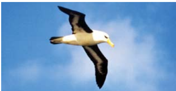
Black-browed albatross.

Conservation of species that roam the oceans, such as albatross and petrels, cannot be achieved by one country alone. Australia has encouraged other countries to work together to complement our national policies and actions. Perhaps the most important initiative taken is the Agreement on the Conservation of Albatrosses and Petrels (ACAP), Australia is a signatory and hosts the Secretariat. ACAP's role is to encourage international cooperation and put in place conservation measures such as, reducing bycatch in fisheries, eradicating of feral species at breeding sites and preventing habitat loss.