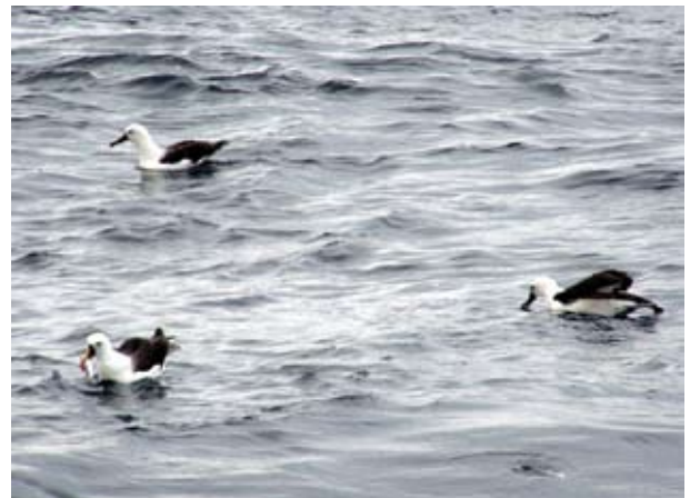
Albatross on the water.

19 are threatened with extinction. Australia has critical habitats for the breeding and feeding of albatrosses. Macquarie Island is listed as a critical habitat for the Wandering and Grey-headed Albatrosses. Albatross Island, Pedra Branca and the Mewstone are listed as critical habitats for the Shy Albatross.